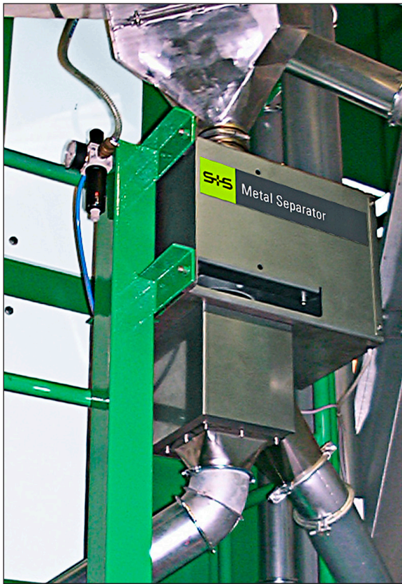
Installation example: Metal separator RAPID 4000-FS used for quality control at a filling station for dried vegetable (old version)