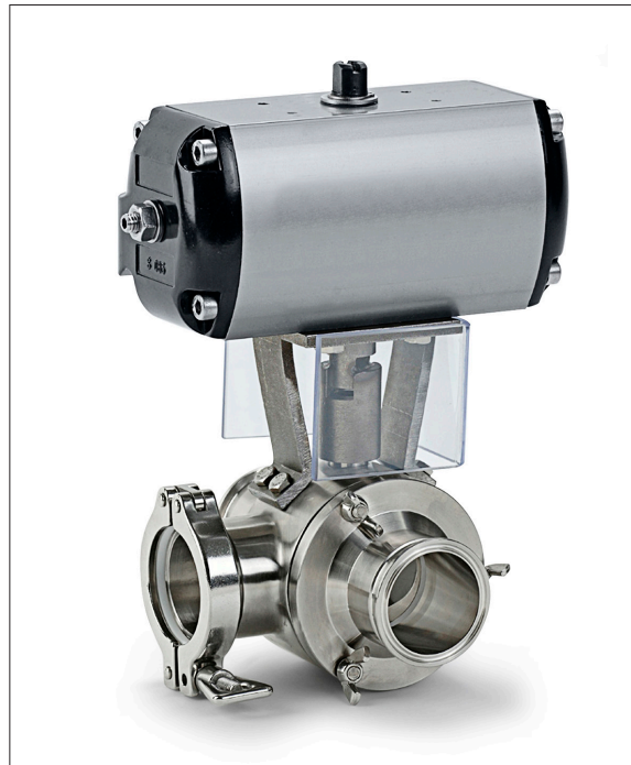
Separating system: Ball valve