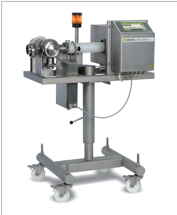
LIQUISCAN PL with height-adjustable stand