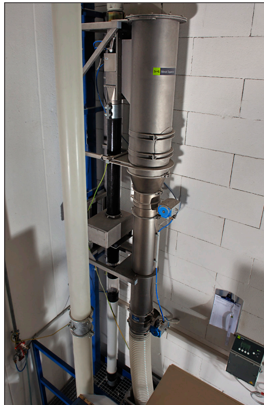
Installation example: GF 4000 metal separation systems installed in vertical pressure pipes. (old version)

Contaminated material is rejected into a container without any interruption to the production process. The reject container is emptied automatically.