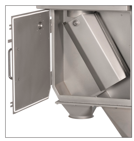
Separation unit with opened cleaning flap.

The RAPID 6000 metal separator primarily is used in industries with high hygienic demands.