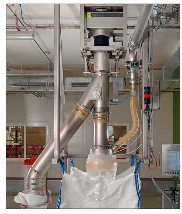
Installation example: IFS compliant metal detection directly before the filling of spice products into bigbags. (old version)